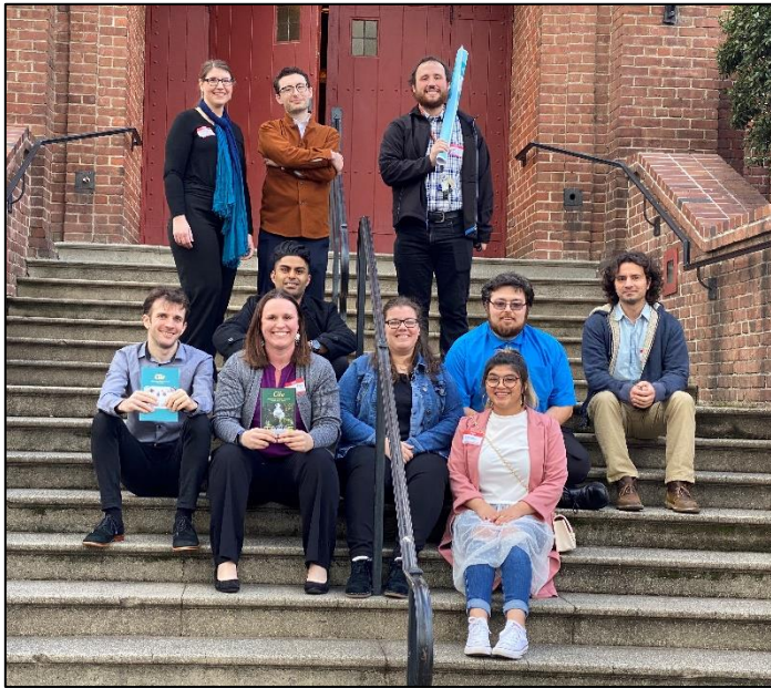
Phi Alpha Theta Northern California Regional Conference, 2020